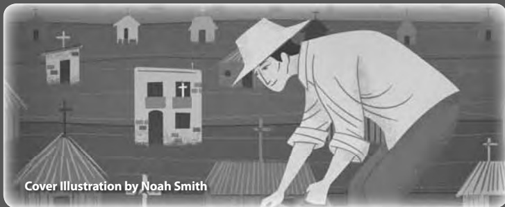
Cover Illustration by Noah Smith